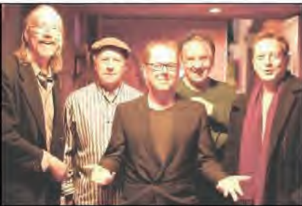
The Whirling Furphies

Saturday morning's market at the school with be jazzed up this time with several of the festival acts performing there during the morning.