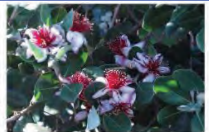
Christmas Colours: Feijoa Blossom

Harcourt Valley Primary School has very generously offered us some working space at the school and we hope to set this space up in the new year. Hard copy submissions for the paper can be left at the school.