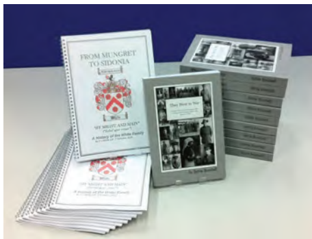
Samples of finished books from Collier Office & Business Assist.